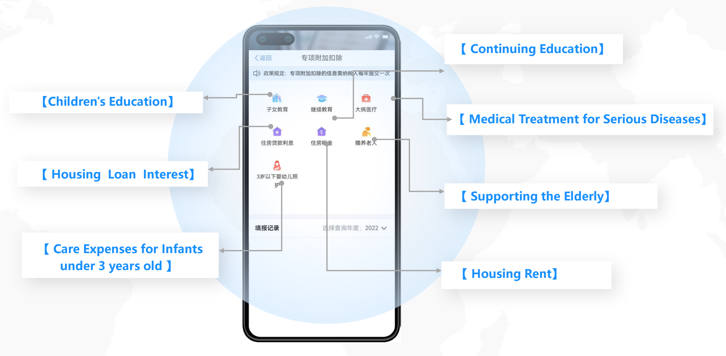
Taking 'Special additional deduction Report' as an Example